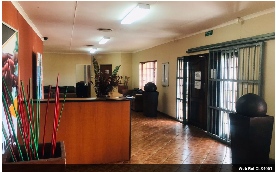
Web Ref CLS4051

Lira Link Rd, Unit 2 Montego Park, Richards Bay Central, Richards Bay, 3900