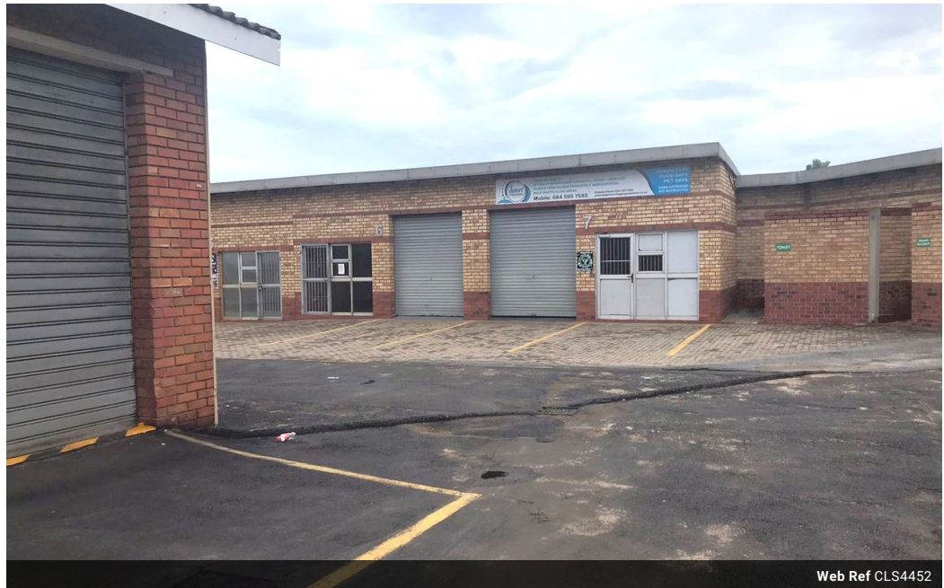
Web Ref CLS4452

Lira Link Rd, Unit 2 Montego Park, Richards Bay Central, Richards Bay, 3900