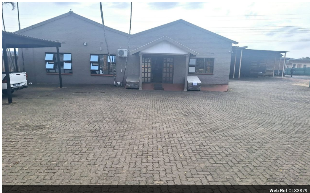
Web Ref CLS3879

Lira Link Rd, Unit 2 Montego Park, Richards Bay Central, Richards Bay, 3900