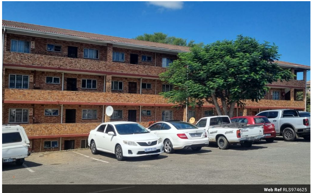
Web Ref RLS974625

Lira Link Rd, Unit 2 Montego Park, Richards Bay Central, Richards Bay, 3900