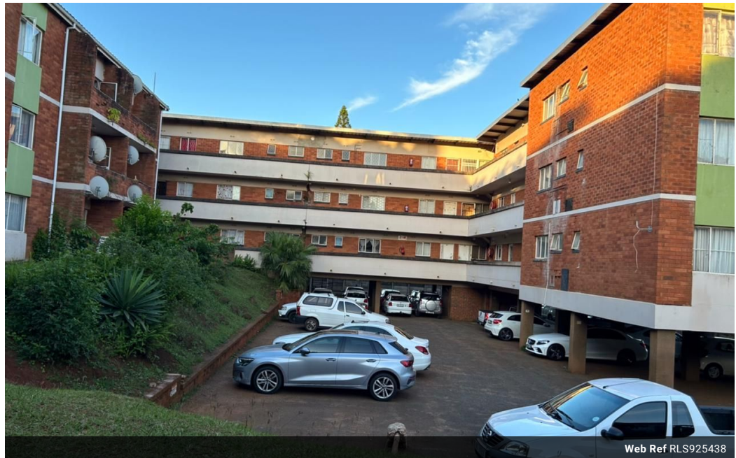
Web Ref RLS925438

Lira Link Rd, Unit 2 Montego Park, Richards Bay Central, Richards Bay, 3900