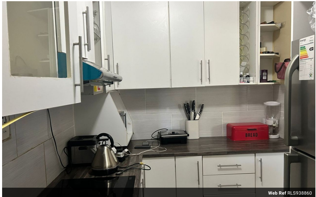
Web Ref RLS938860

Lira Link Rd, Unit 2 Montego Park, Richards Bay Central, Richards Bay, 3900