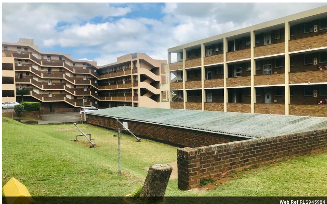
Web Ref RLS945984

Lira Link Rd, Unit 2 Montego Park, Richards Bay Central, Richards Bay, 3900