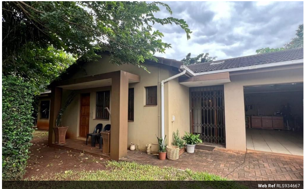
Web Ref RLS934667

Lira Link Rd, Unit 2 Montego Park, Richards Bay Central, Richards Bay, 3900