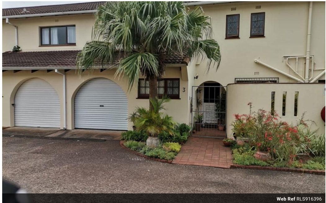
Web Ref RLS916396

Lira Link Rd, Unit 2 Montego Park, Richards Bay Central, Richards Bay, 3900