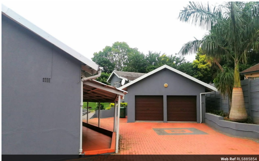
Web Ref RLS885854

Lira Link Rd, Unit 2 Montego Park, Richards Bay Central, Richards Bay, 3900