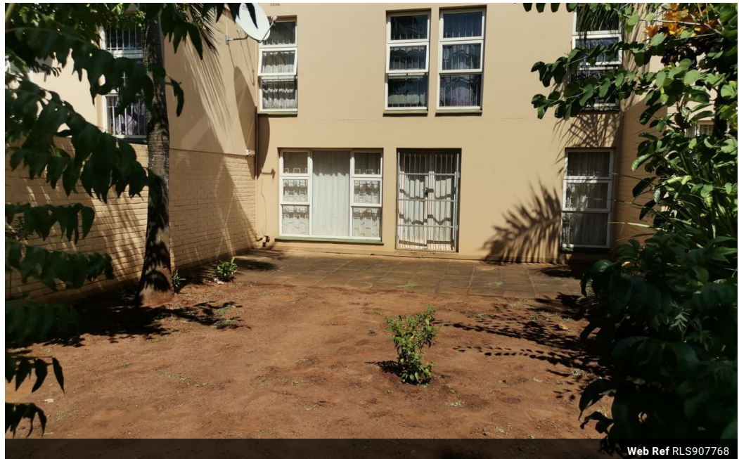
Web Ref RLS907768

Lira Link Rd, Unit 2 Montego Park, Richards Bay Central, Richards Bay, 3900