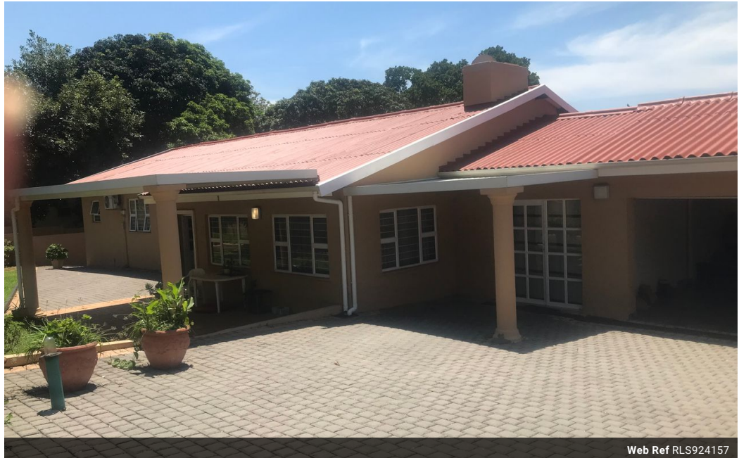
Web Ref RLS924157

Lira Link Rd, Unit 2 Montego Park, Richards Bay Central, Richards Bay, 3900