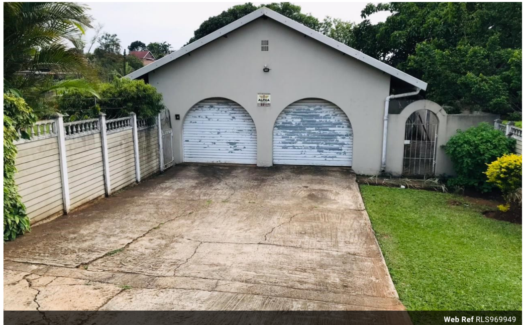
Web Ref RLS969949

Lira Link Rd, Unit 2 Montego Park, Richards Bay Central, Richards Bay, 3900