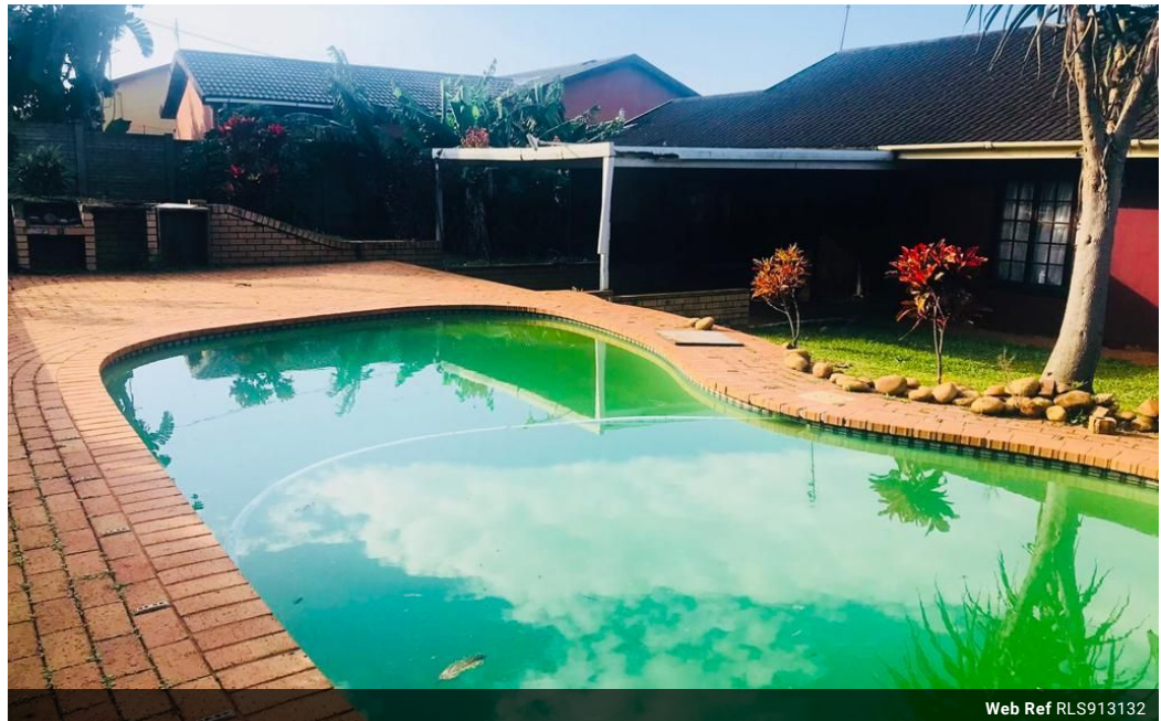
Web Ref RLS913132

Lira Link Rd, Unit 2 Montego Park, Richards Bay Central, Richards Bay, 3900