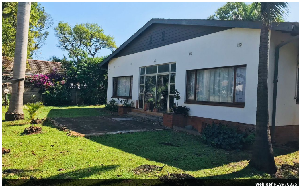
Web Ref RLS970335

Lira Link Rd, Unit 2 Montego Park, Richards Bay Central, Richards Bay, 3900