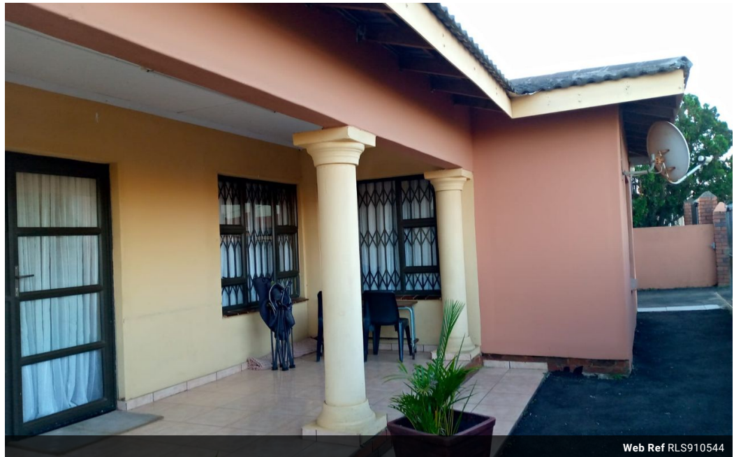
Web Ref RLS910544

Lira Link Rd, Unit 2 Montego Park, Richards Bay Central, Richards Bay, 3900