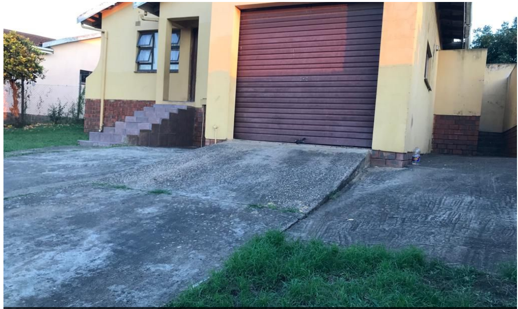
Web Ref RLS911081

Lira Link Rd, Unit 2 Montego Park, Richards Bay Central, Richards Bay, 3900