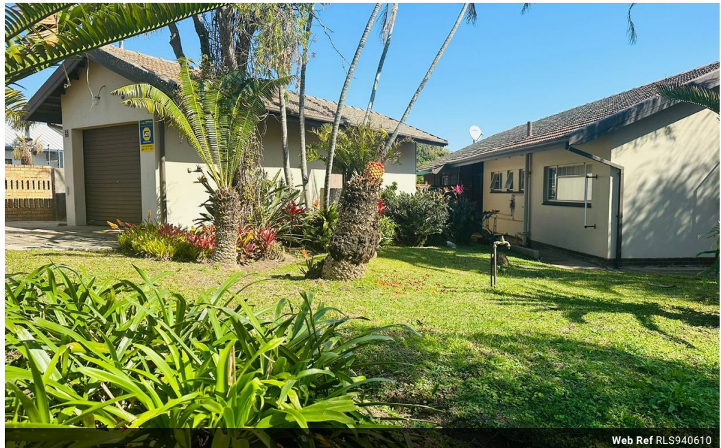
Web Ref RLS940610

Lira Link Rd, Unit 2 Montego Park, Richards Bay Central, Richards Bay, 3900