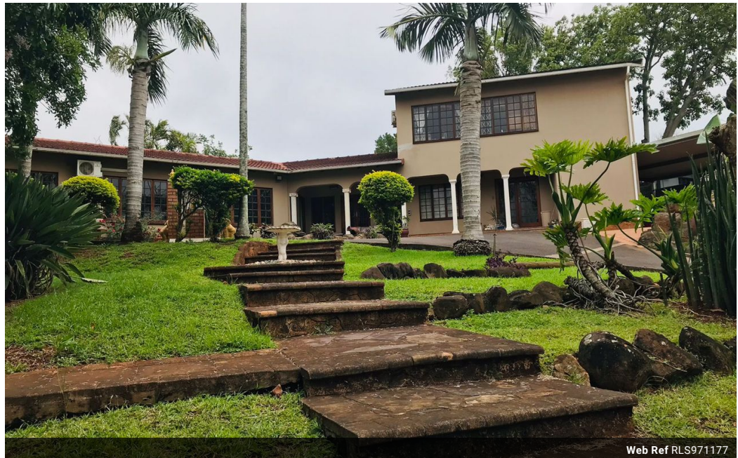
Web Ref RLS971177

Lira Link Rd, Unit 2 Montego Park, Richards Bay Central, Richards Bay, 3900