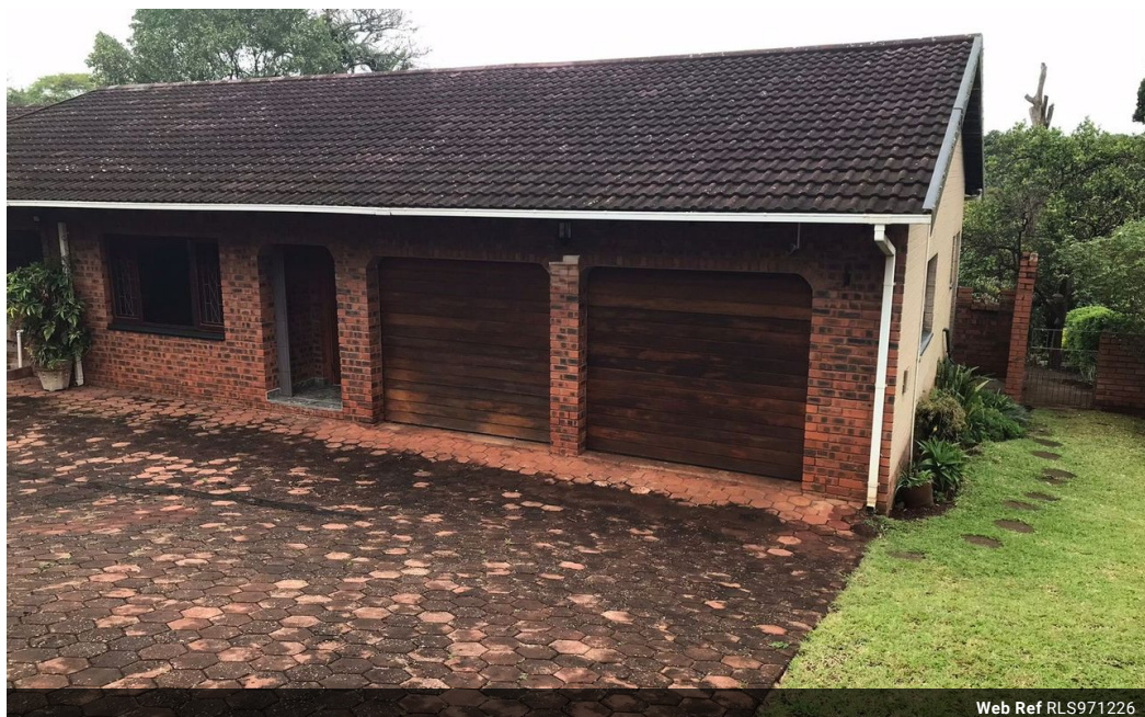
Web Ref RLS971226

Lira Link Rd, Unit 2 Montego Park, Richards Bay Central, Richards Bay, 3900