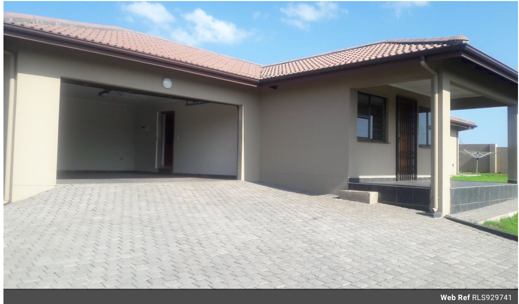
Web Ref RLS929741

Lira Link Rd, Unit 2 Montego Park, Richards Bay Central, Richards Bay, 3900