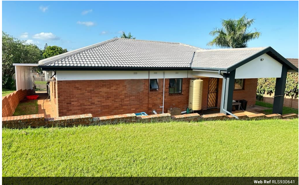
Web Ref RLS930641

Lira Link Rd, Unit 2 Montego Park, Richards Bay Central, Richards Bay, 3900