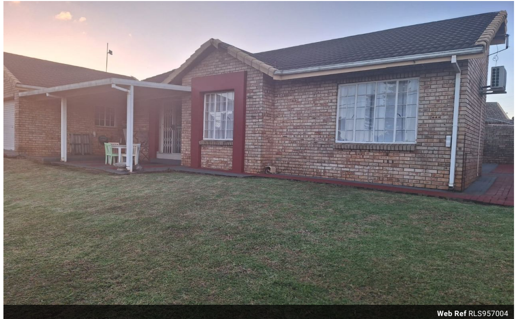
Web Ref RLS957004

Lira Link Rd, Unit 2 Montego Park, Richards Bay Central, Richards Bay, 3900