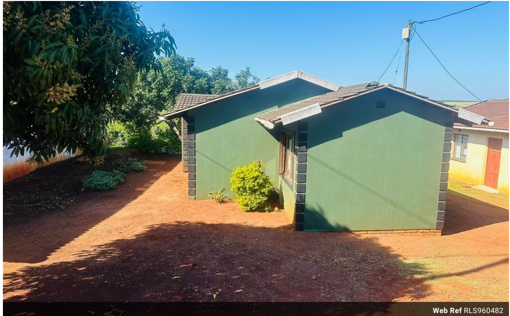
Web Ref RLS960482

Lira Link Rd, Unit 2 Montego Park, Richards Bay Central, Richards Bay, 3900