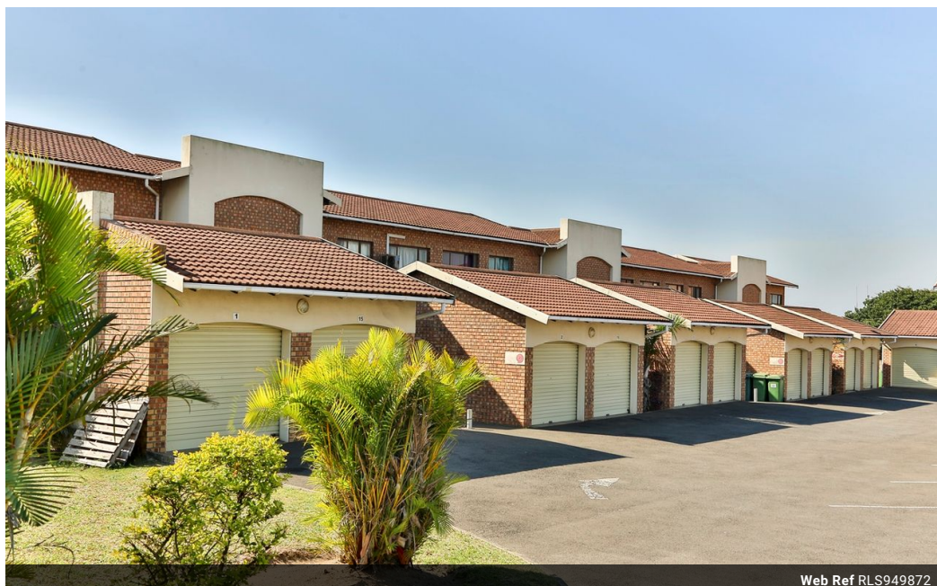
Web Ref RLS949872

Lira Link Rd, Unit 2 Montego Park, Richards Bay Central, Richards Bay, 3900