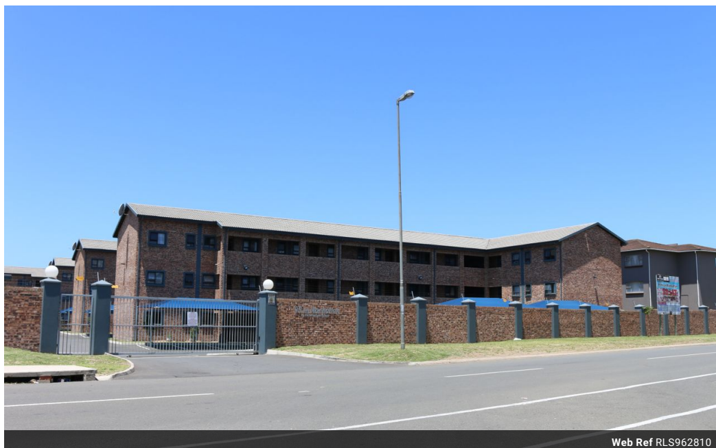
Web Ref RLS962810

Lira Link Rd, Unit 2 Montego Park, Richards Bay Central, Richards Bay, 3900