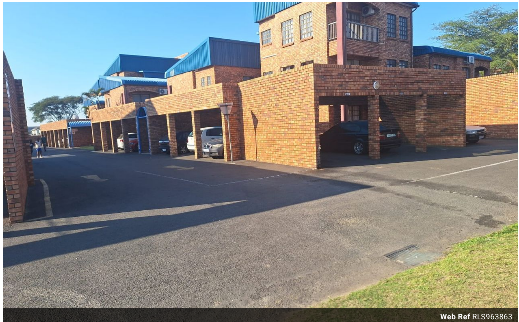
Web Ref RLS963863

Lira Link Rd, Unit 2 Montego Park, Richards Bay Central, Richards Bay, 3900