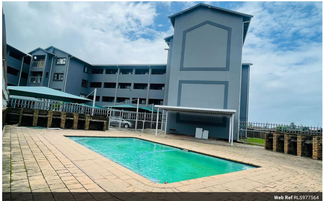
Web Ref RLS977564

Lira Link Rd, Unit 2 Montego Park, Richards Bay Central, Richards Bay, 3900