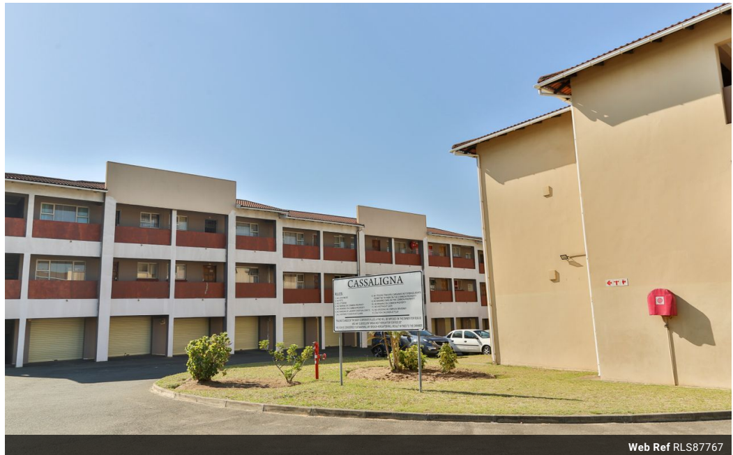
Web Ref RLS87767

Lira Link Rd, Unit 2 Montego Park, Richards Bay Central, Richards Bay, 3900