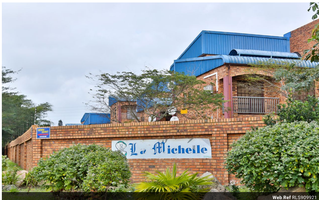
Web Ref RLS909921

Lira Link Rd, Unit 2 Montego Park, Richards Bay Central, Richards Bay, 3900