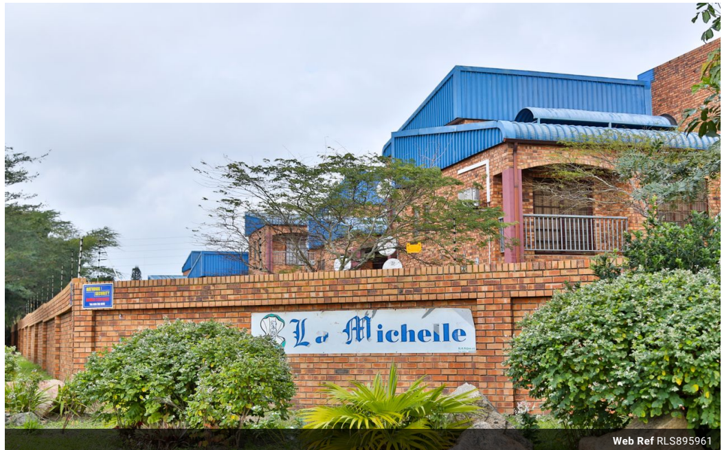
Web Ref RLS895961

Lira Link Rd, Unit 2 Montego Park, Richards Bay Central, Richards Bay, 3900