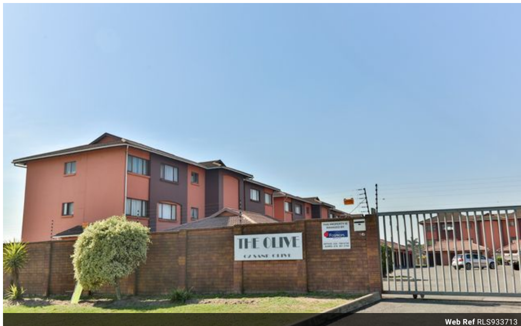
Web Ref RLS933713

Lira Link Rd, Unit 2 Montego Park, Richards Bay Central, Richards Bay, 3900