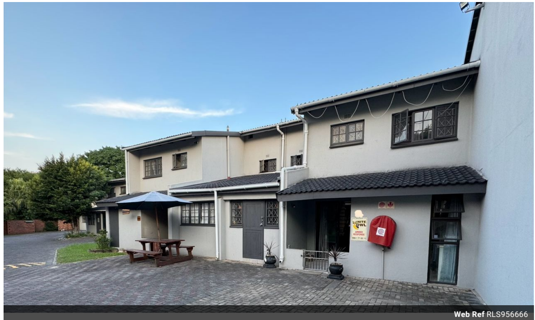
Web Ref RLS95666

Lira Link Rd, Unit 2 Montego Park, Richards Bay Central, Richards Bay, 3900