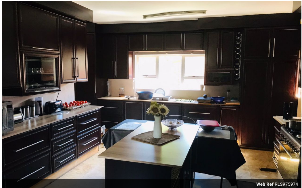
Web Ref RLS975974

Lira Link Rd, Unit 2 Montego Park, Richards Bay Central, Richards Bay, 3900