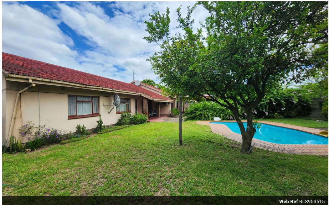
Web Ref RLS953515

Lira Link Rd, Unit 2 Montego Park, Richards Bay Central, Richards Bay, 3900