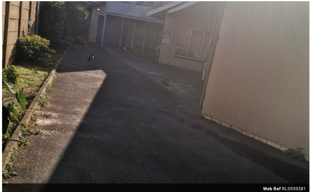
Web Ref RLS959281

Lira Link Rd, Unit 2 Montego Park, Richards Bay Central, Richards Bay, 3900