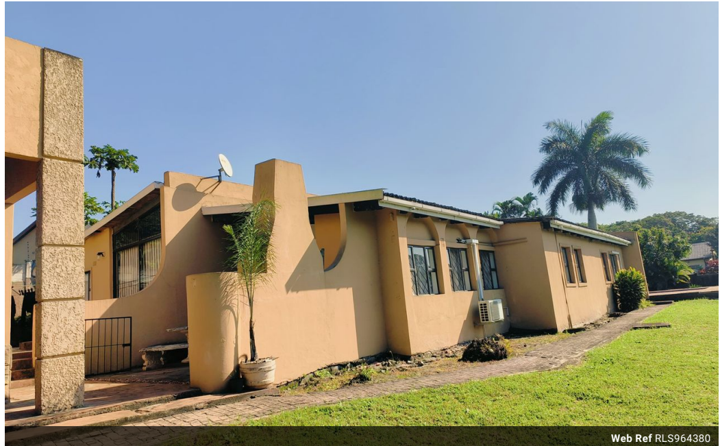
Web Ref RLS964380

Lira Link Rd, Unit 2 Montego Park, Richards Bay Central, Richards Bay, 3900