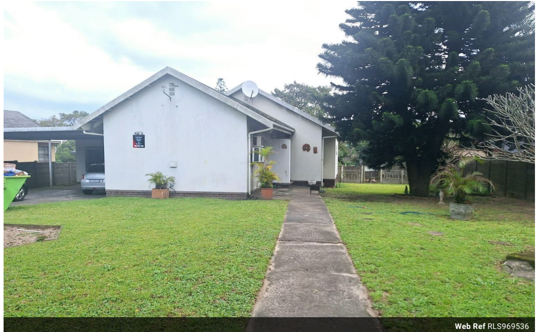
Web Ref RLS969536

Lira Link Rd, Unit 2 Montego Park, Richards Bay Central, Richards Bay, 3900