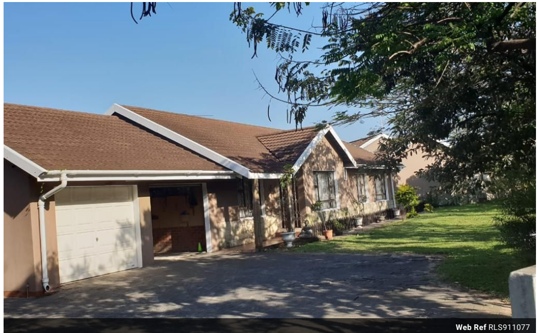
Web Ref RLS911077

Lira Link Rd, Unit 2 Montego Park, Richards Bay Central, Richards Bay, 3900