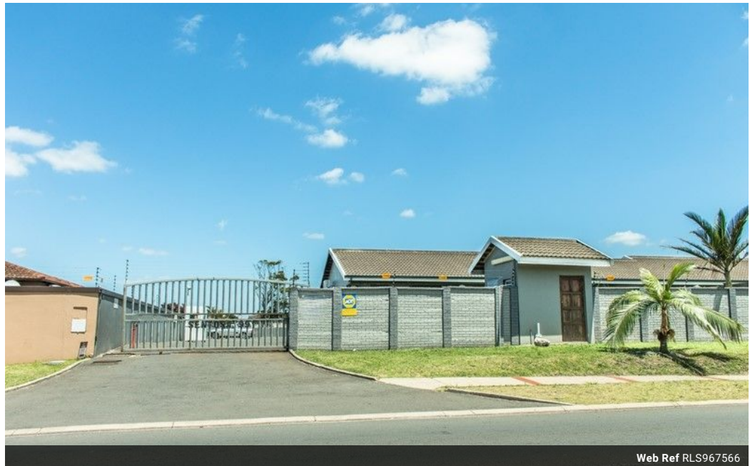
Web Ref RLS967566

Lira Link Rd, Unit 2 Montego Park, Richards Bay Central, Richards Bay, 3900