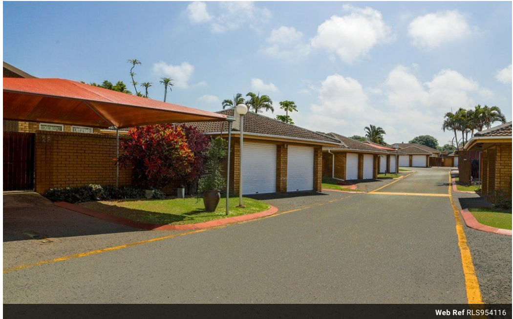
Web Ref RLS954116

Lira Link Rd, Unit 2 Montego Park, Richards Bay Central, Richards Bay, 3900