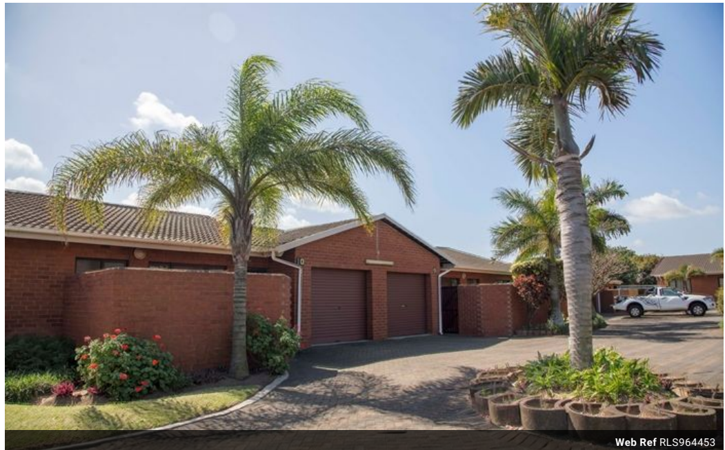
Web Ref RLS964453

Lira Link Rd, Unit 2 Montego Park, Richards Bay Central, Richards Bay, 3900