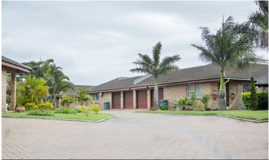
Web Ref RLS888922

Lira Link Rd, Unit 2 Montego Park, Richards Bay Central, Richards Bay, 3900