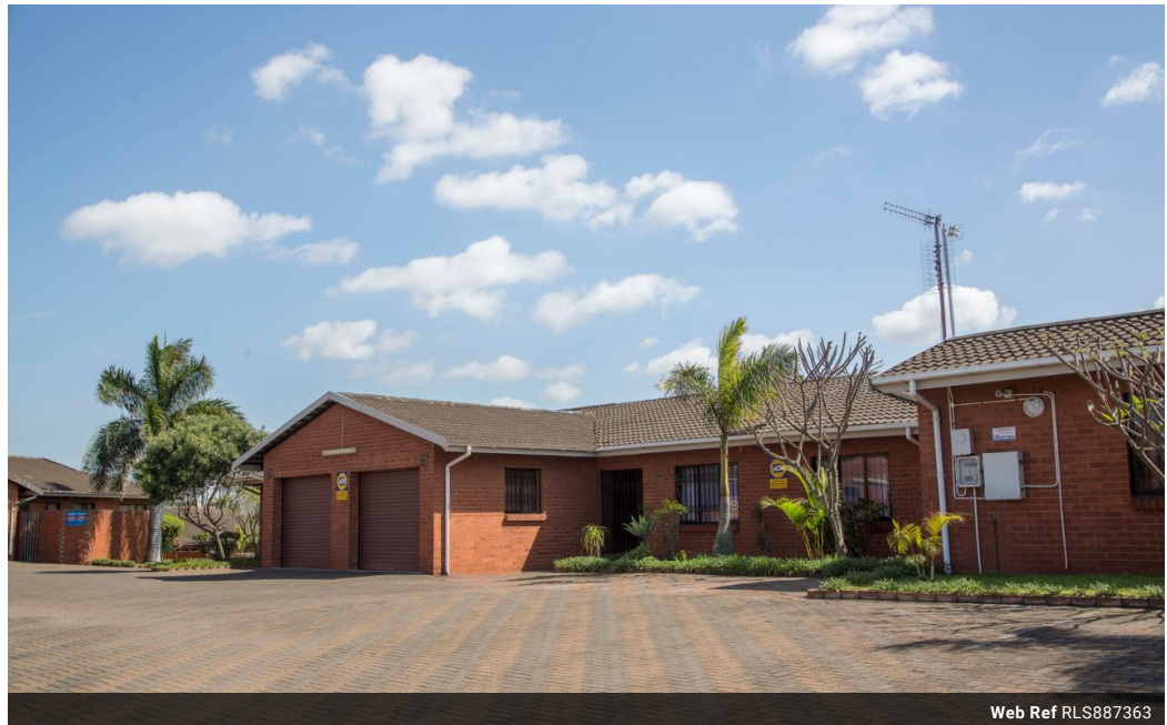
Web Ref RLS887363

Lira Link Rd, Unit 2 Montego Park, Richards Bay Central, Richards Bay, 3900