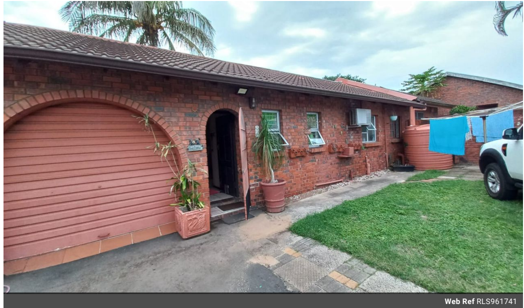
Web Ref RLS961741

Lira Link Rd, Unit 2 Montego Park, Richards Bay Central, Richards Bay, 3900