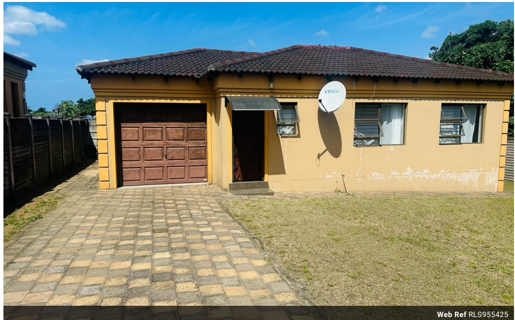
Web Ref RLS955425

Lira Link Rd, Unit 2 Montego Park, Richards Bay Central, Richards Bay, 3900