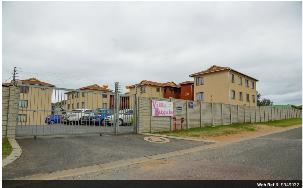
Web Ref RLS949932

Lira Link Rd, Unit 2 Montego Park, Richards Bay Central, Richards Bay, 3900