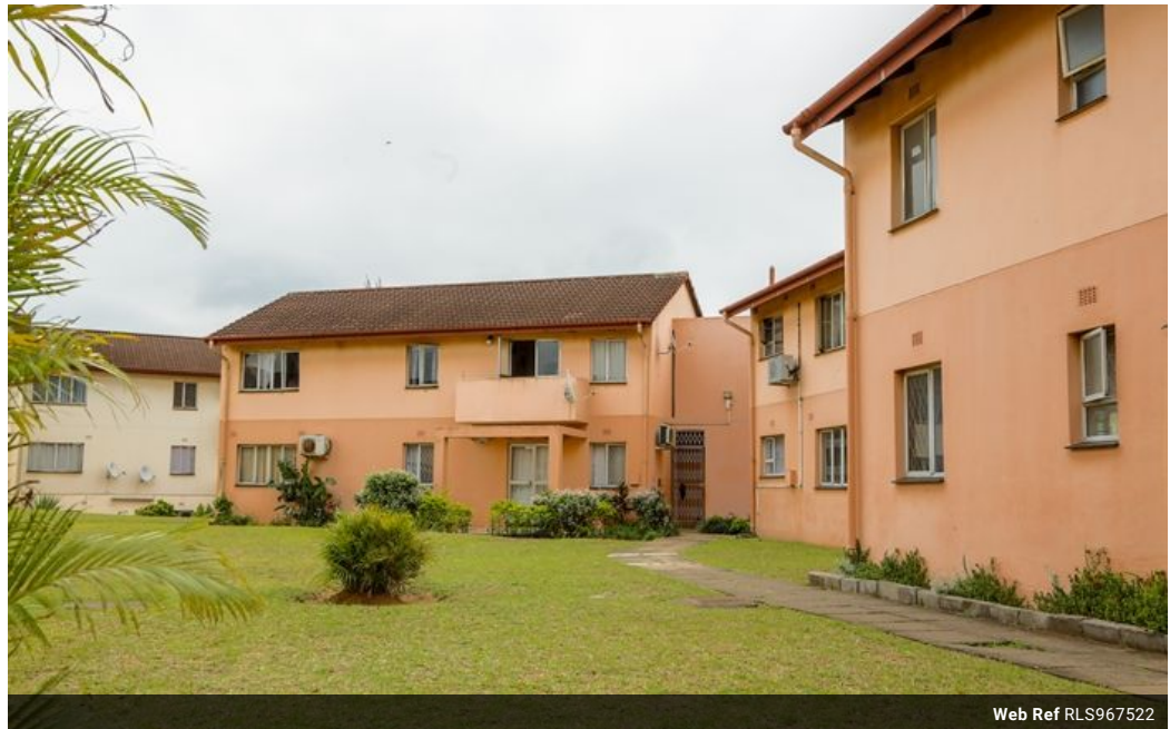
Web Ref RLS967522

Lira Link Rd, Unit 2 Montego Park, Richards Bay Central, Richards Bay, 3900