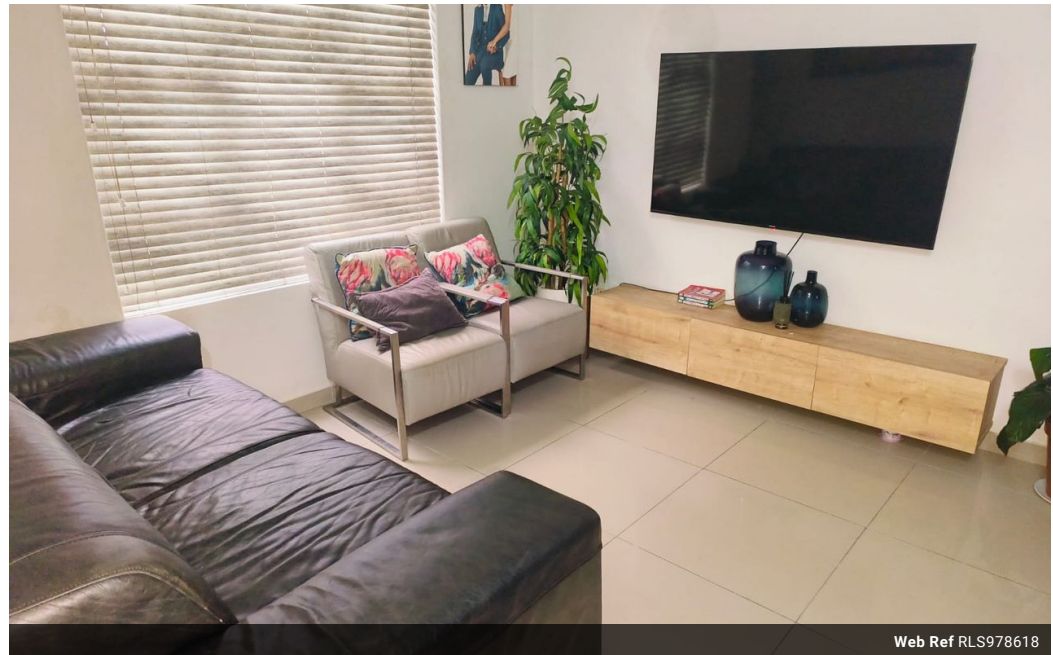
Web Ref RLS978618

Lira Link Rd, Unit 2 Montego Park, Richards Bay Central, Richards Bay, 3900