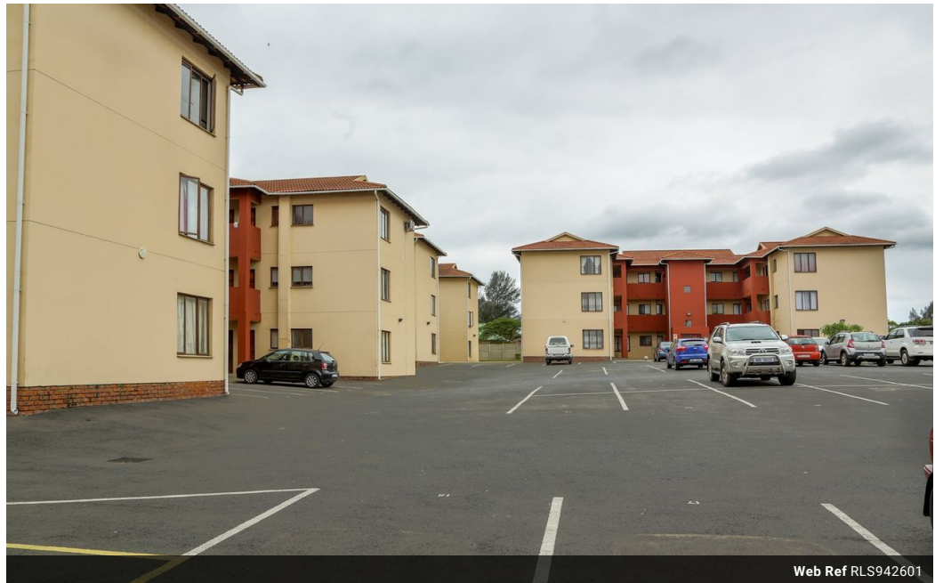
Web Ref RLS942601

Lira Link Rd, Unit 2 Montego Park, Richards Bay Central, Richards Bay, 3900